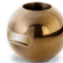
» PVD UltraImpact EXCELL®