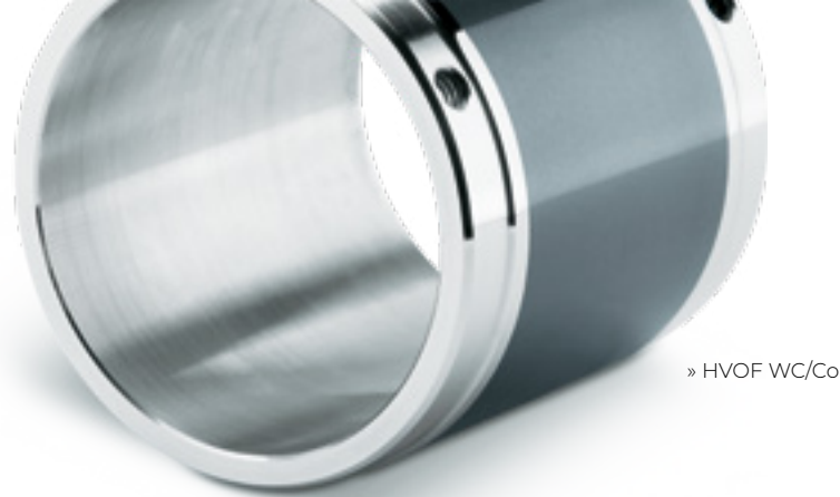
» HVOF WC/Co