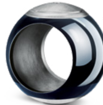
» APS TiO 2